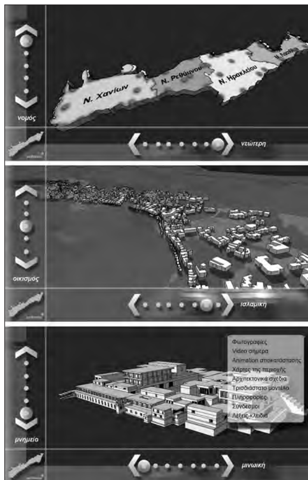
Figure 2. Three modes of the application's interface.