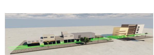
Figure 2. Translation of 1866 Square at Chania (Greece) to music