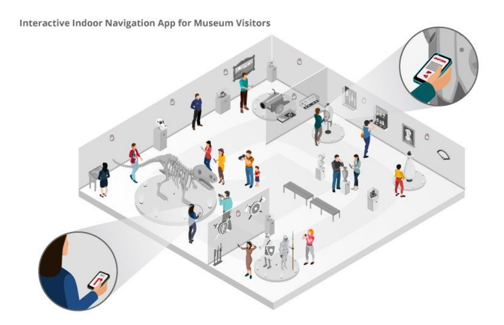
Figure 2 Fig. 2. Interactive Indoor Navigation App for Museum Visitors

sensory information collected by a smartphone device or tablet. The case of having a hyperconnected, personalized "lifelong" user model provides a starting point for personalization. So far, we could understand users' conducts from the past, analyzing their behavior prior and after their visit and comparing it with other users trying to find common points. Hence, allowing museums to design their events based on studies conducted. Our approach allows to create a model where the most pivotal element is relevancy and how quickly museums can address the needs and adopt to the users' expectations in the most fulfilling way. By taking advantage of the state of the art technology, users, carry with them, and museums have access to.