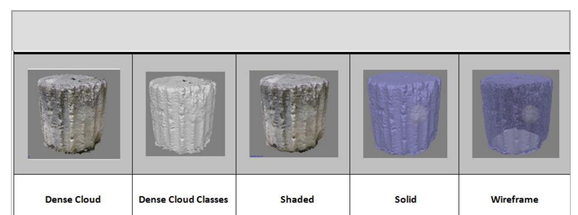
Fig.4 The different types of the drum's S1 3D model