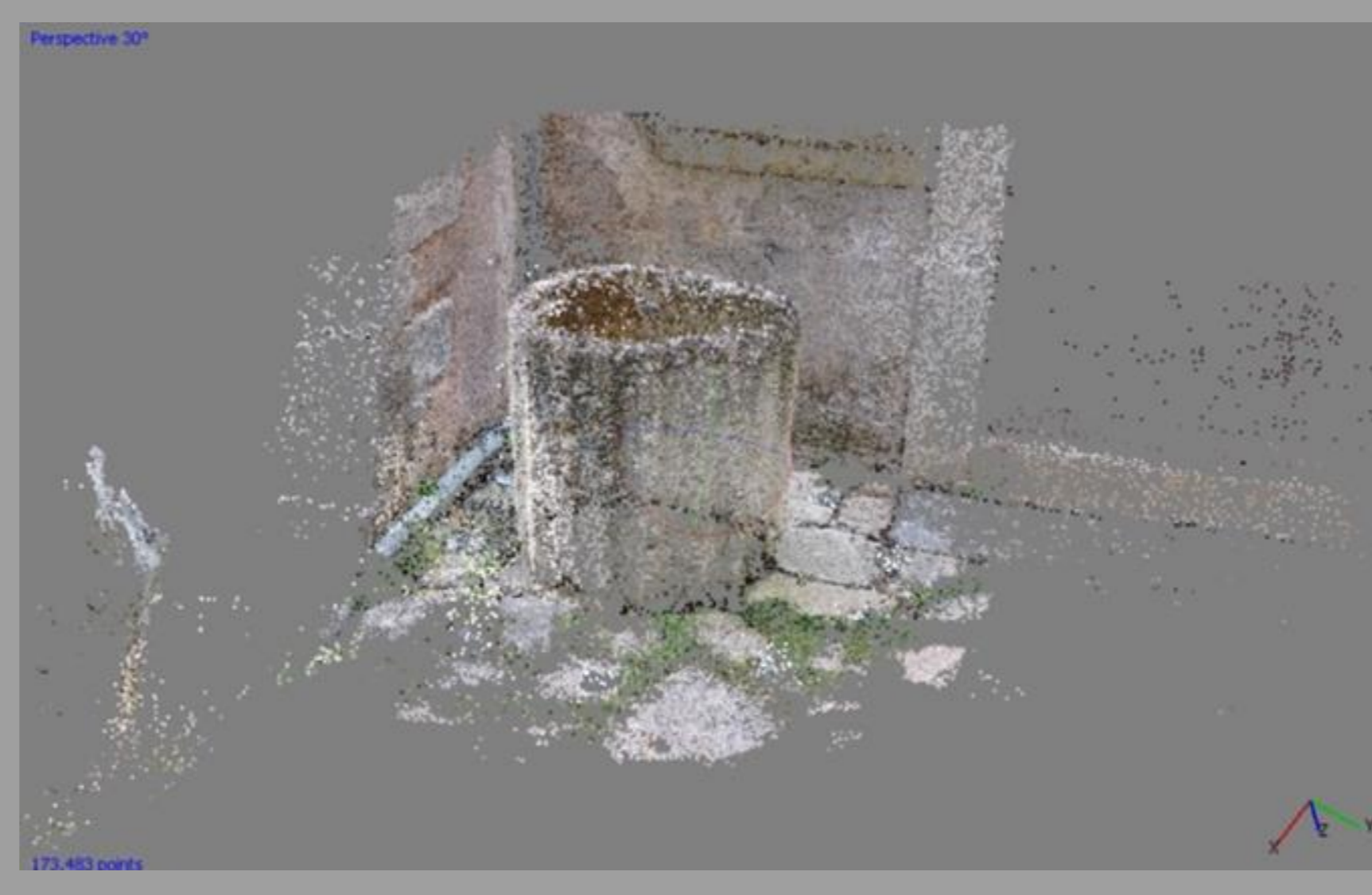
Fig.3 The point cloud of drum S1

The 3d files exported from Agisoft were in obj format and were imported in 3ds Max. Each file was rescaled and the adjustment of the scale was realised manually according to the measurements of the items. The rescaled models were then merged into a single file (Fig.5).