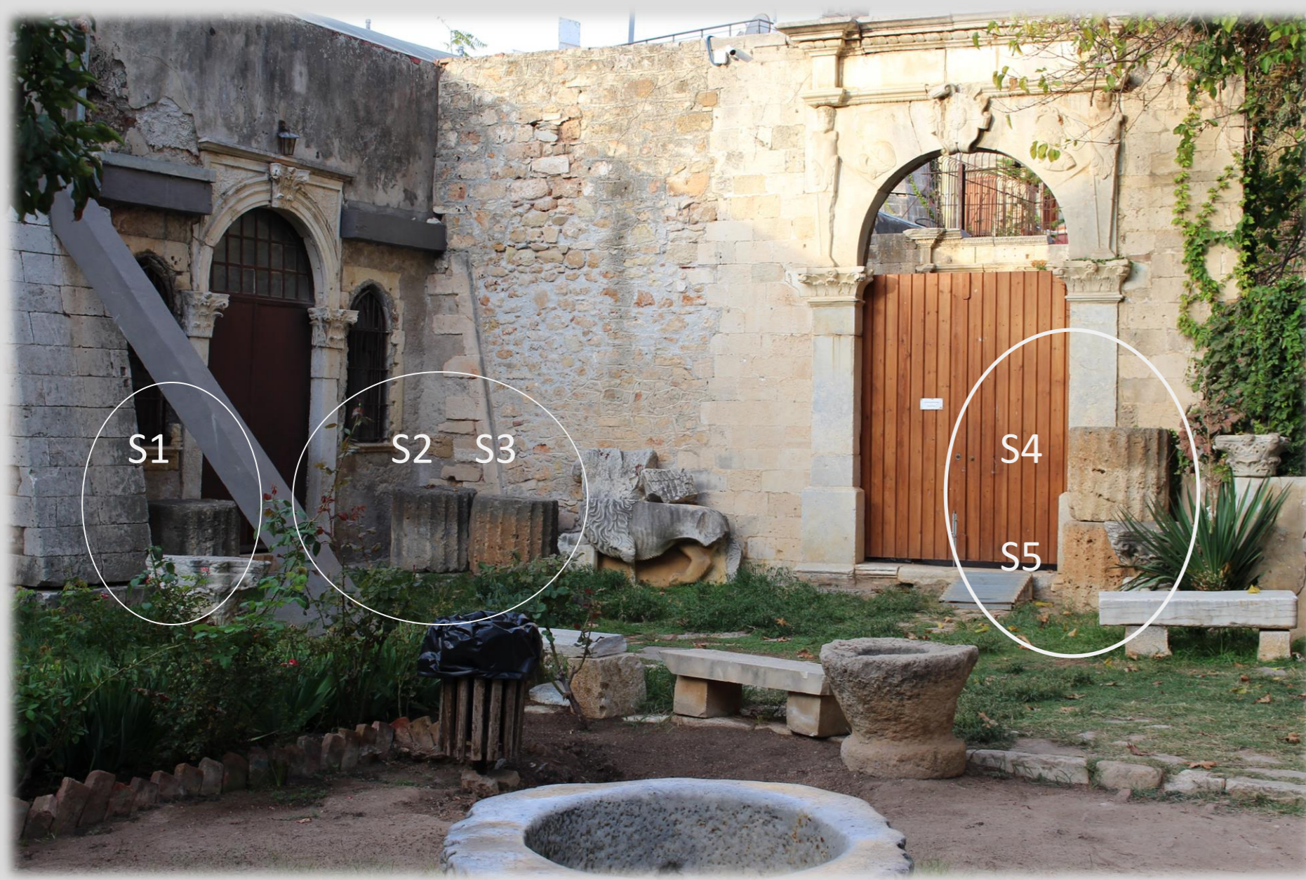
Fig.1 The five stone drums of the archaic column are exposed in the yard of the Archaeological Museum of Chania, Greece

We would like to present a project which was realised in the Digital Media Lab, in the School of Architecture at the Technical University of Crete. The aim of the project is to use 3D models of five very heavy parts of an archaic column for studying and reconstructing the complete column.