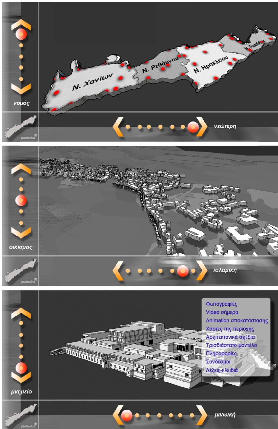
Figure 2: three modes of the application's interface