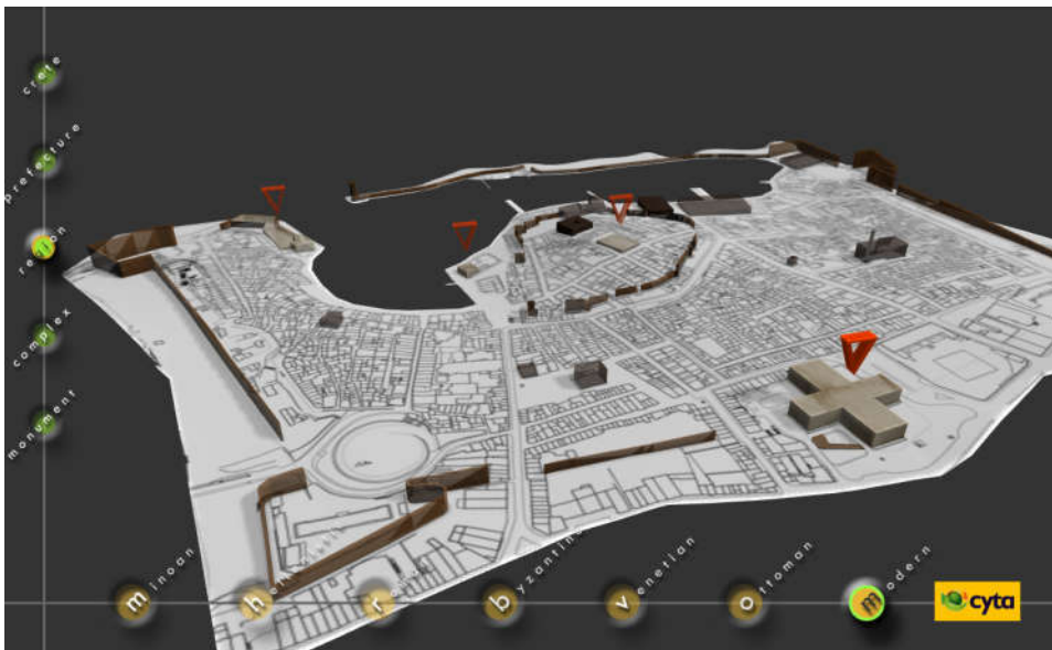
Figure 04. Interface - Region Level