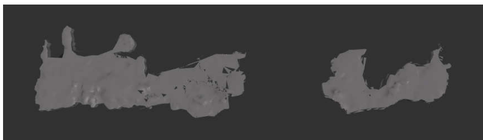
Figure 02. 'Broken texture' effect